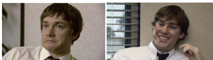
Plates 8 and 9: Tim's chagrin and Jim's wry grin

Finally, a major difference between the American and the British version of The Office is the relationship between Tim and Dawn (UK) or Jim and Pam (US).