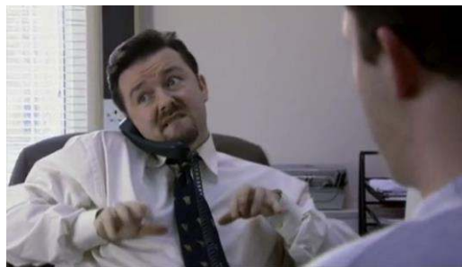
Plate 3: Outrageous gestures

The incipit of the “documentary” itself may confirm this realism, as it is composed of static “head shots”, without any lighting or visual effects to heighten the aesthetic rather than the didactic value of the images. However, the character being filmed seems just that, a character, whose outrageous gestures and expressions (see Plate 3) belie any misguided belief that this is an ordinary documentary.