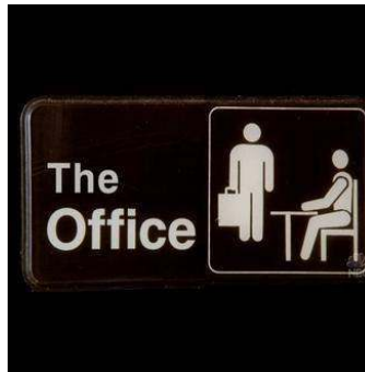
Plate 6: The Office logo

Here, then, any generic uncertainty is immediately dispelled: though it may take on the trappings of a documentary, clearly this is a sitcom, with actors playing parts and future episodes yet to come. Likewise, once the episode itself begins, the impact of Michael Scott's blundering is not immediate, and his demeanor is much less outrageous than David Brent's: one can assume that since American viewers are assured of the comedy to come, there is no need to make the markers of the main character's buffoonery so immediately obvious.