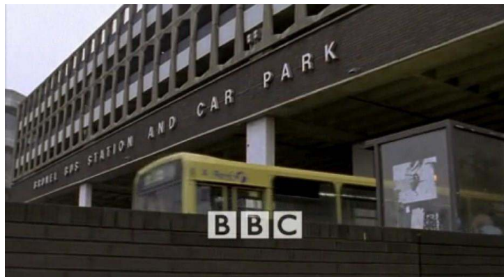
Plate 1: BBC Credits

Though the opening music is instrumental, the closing music does have the lyrics; in any case, it would have been known well enough to have been recognizable for the viewer, and the melancholy and nostalgia would have been obvious; the comedy much less so. When we add to this the montage of grey images of the city of Slough as an industrial wasteland (see Plate 1) and the lack of credits for different actors, it's understandable that many took the show for a documentary given its style and the lack of any real advertising for it beforehand.