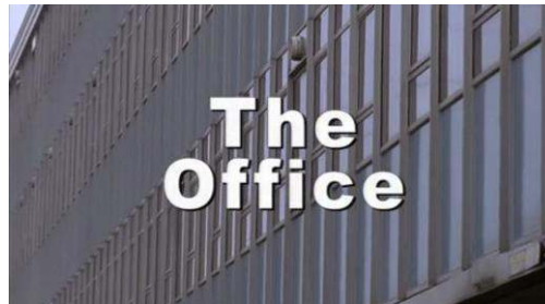
Plate 2: BBC Credits

The incipit of the “documentary” itself may confirm this realism, as it is composed of static “head shots”, without any lighting or visual effects to heighten the aesthetic rather than the didactic value of the images. However, the character being filmed seems just that, a character, whose outrageous gestures and expressions (see Plate 3) belie any misguided belief that this is an ordinary documentary.